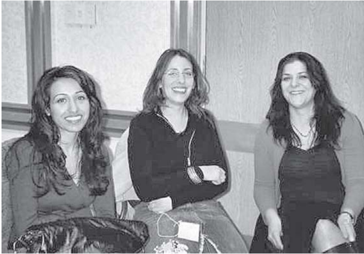
Workshop visitors from England